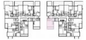
GROUND FLOOR - BLOCK A