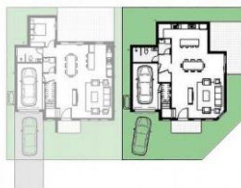
LOT PLAN 80 SCHOFIELDS ROAD