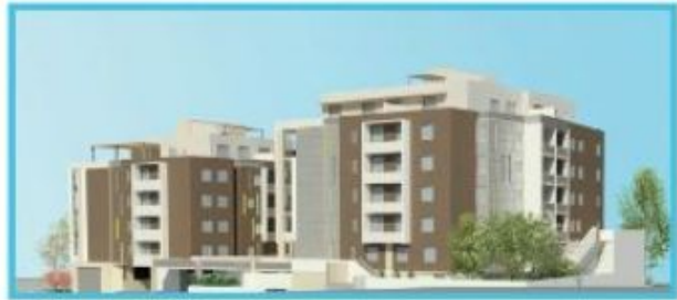
3D - VIEW