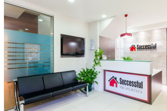
Successful Properties 9688 2097