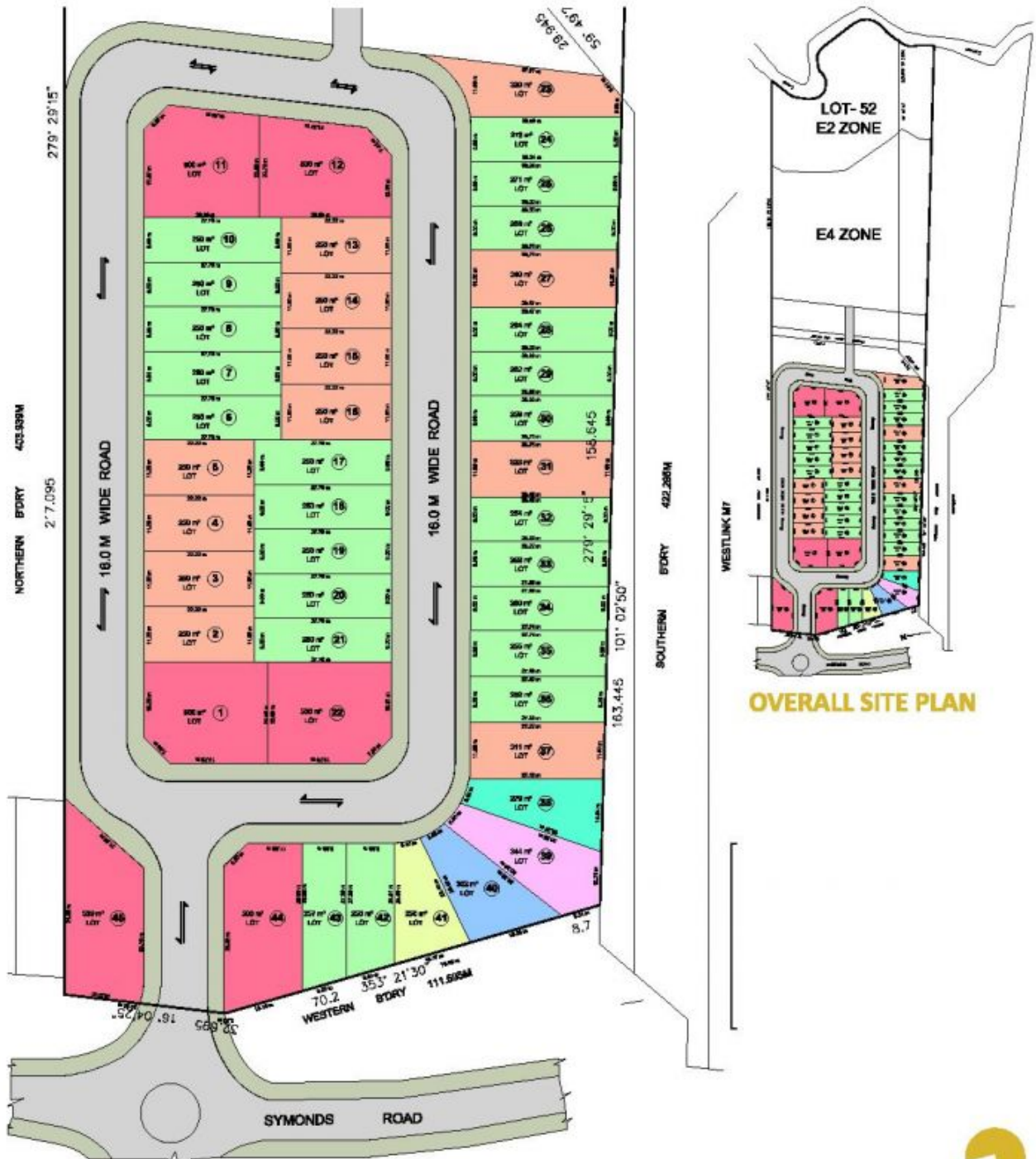
OVERALL SITE PLAN