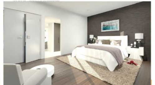
3D VIEW MASTERBEDROOM