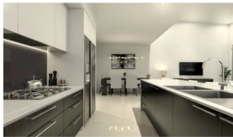
3D VIEW- KITCHEN