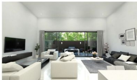
3D VIEW - LIVING AREA