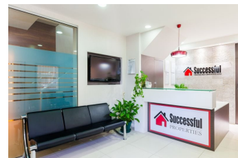
Successful Properties 9688 2097