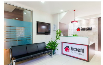
Successful Properties 9688 2097