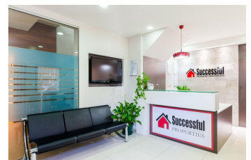
Successful Properties 9688 2097