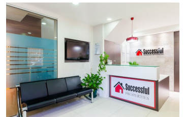
Successful Properties 9688 2097