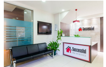
Successful Properties 9688 2097