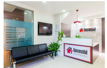
Successful Properties 9688 2097