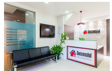
Successful Properties 9688 2097