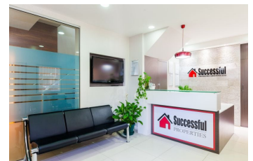
Successful Properties 9688 2097