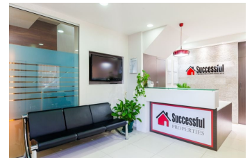
Successful Properties 9688 2097