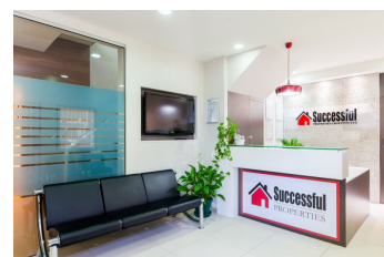
Successful Properties 9688 2097