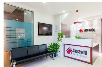
Successful Properties 9688 2097