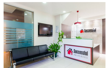
Successful Properties 9688 2097