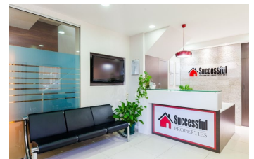
Successful Properties 9688 2097