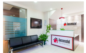
Successful Properties 9688 2097