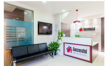
Successful Properties 9688 2097