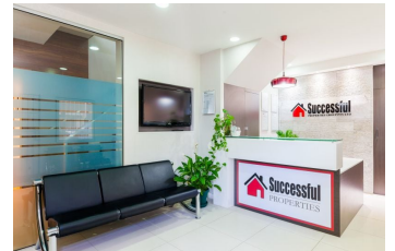
Successful Properties 9688 2097